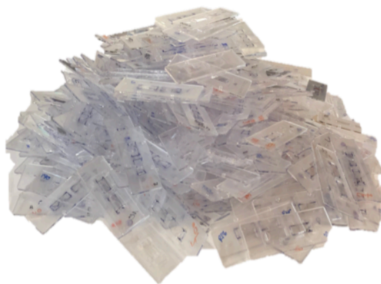
1000 used slides