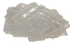
Only 20 re-used slide